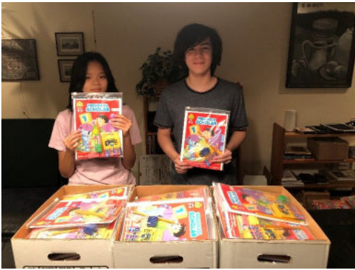
Charter School of Wilmington students helped assemble 400 Literacy Kits

United Way volunteers assembled 500 Literacy Kits and PREP volunteers made 400. The two nonprofit organizations will distribute the kits to schools and preschool centers throughout September.