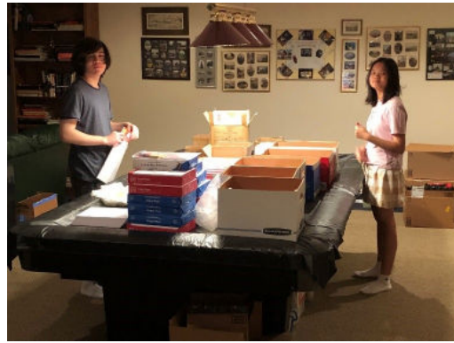
UWDE Volunteers assembled 500 Literacy Kits.